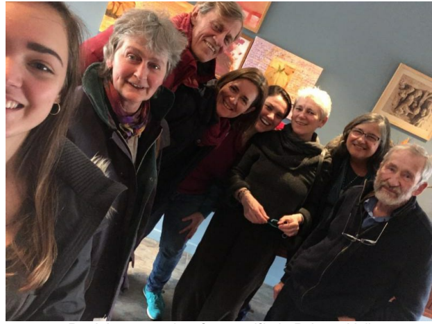
Participants gather for a selfie in Paloma Hall