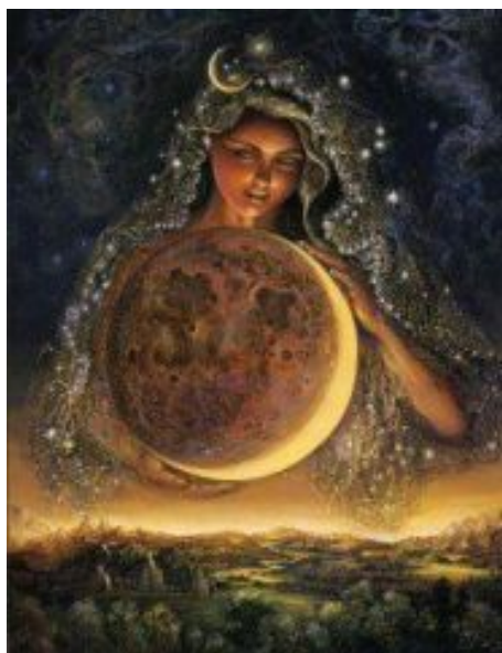
The crescent moon passed low to Earth's surface during the 7th Holy Night